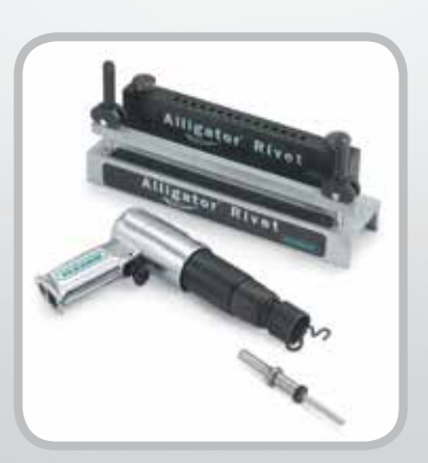
Multiple Rivet Installation Tool Kit

Each kit includes Installation Tool, Belt Hand Skiver, 1 lb. hammer, Pin Bender, and 2 packages of Alligator Rivet, packaged in durable plastic tool box.