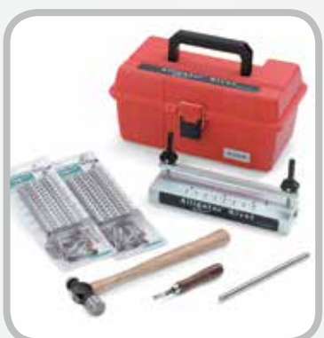
Portable Hand Applicator Tool Kit

Each kit includes Installation Tool, Belt Hand Skiver, 1 lb. hammer, Pin Bender, and 2 packages of Alligator Rivet, packaged in durable plastic tool box.